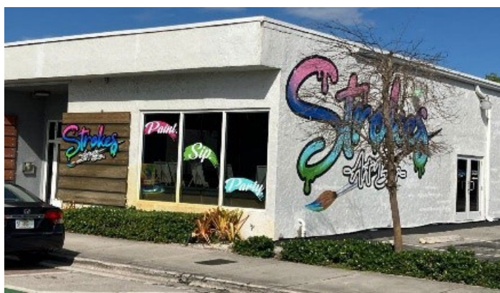
New Business Openings – Central City CRA