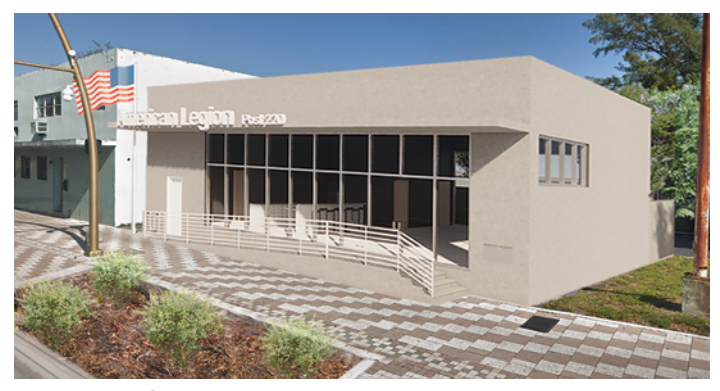
Rendering of American Legion Robert Bethel Post 220 Building