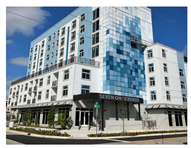
Completion of Seven on Seventh