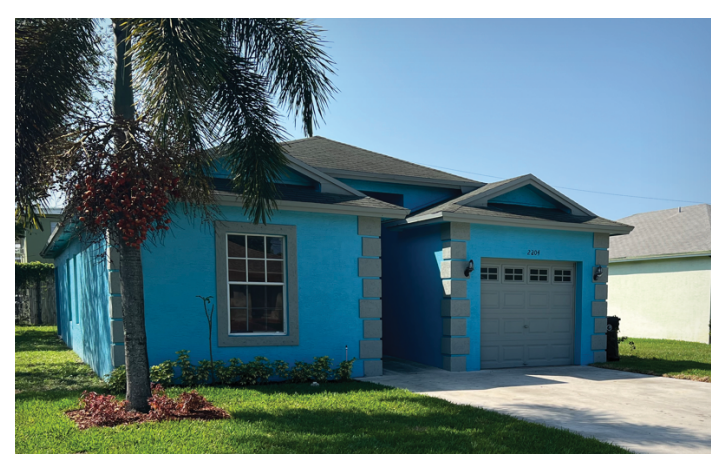
CRA Façade and Landscaping Program Improvements in the Durrs Neighborhod