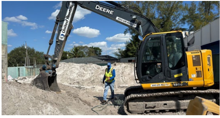
Construction of new American Legion Robert Bethel Post 220