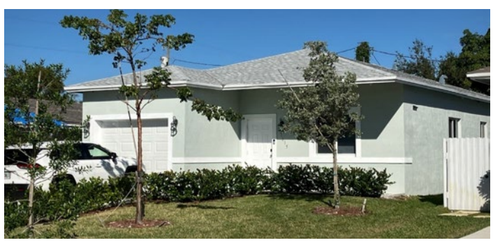
Scattered Site Infill Housing Dorsey Riverbend Neighborhood - Fort Lauderdale CDC