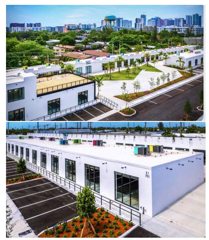
The Thrive Progresso Project

During this reporting period, the CRA also transferred five sites to Lemon City Development, which has begun constructing its first phase of infill housing. Other selected developers include GESMAC Development Inc., Fort Lauderdale CDC, and Oasis of Hope CDC. These developers are actively building homes within the CRA Area that are in various stages of development. This program offers a significantly more affordable path to homeownership in Fort Lauderdale, where the median sale price for single-family homes is currently $575,000.