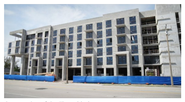
Construction of the The Adderley

Completion of Seven on Seventh at 920 NW 7 Avenue for a mixed-use affordable housing project. The developer, Broward Partnership for the Homeless, Inc., was approved for CRA funding in the amount of $285,000 in FY2021-2022. Seven on Seventh is located on the existing Broward Partnership for the Homeless Central Huizenga Campus. In addition to CRA funding for streetscape improvements surrounding the development, the $28 million project is funded from tax credit equity from a successful award of nine percent Low Income Housing Tax Credits, State of Florida Apartment Incentive Loan (SAIL), ELI Funding, funding from Broward Partnership for the Homeless and bank financing. The affordable housing project consists of 72 rental units, building amenities, new case worker offices, and parking facilities in an eight-story tower, with seven studio/one bath units, 57 one bedroom/ one bath units, and eight two bedroom/two bath units. Amenities include a community room, fitness center, game room, computer lab/business center, interactive library, wellappointed residences, SEER-rated appliances, energy efficient certification, secured key fob access, structured parking, and retail and open promenade space. Half of