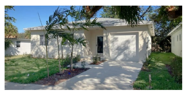
Scattered Site Infill Housing in Durrs Neighborhood - Lemon City Development