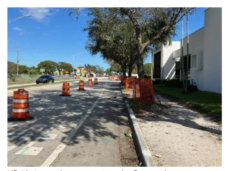
NE 4th Avenue Improvements under Construction

The NE 4 Avenue Complete Street Project is funded in part by Broward County with a Broward Redevelopment Program grant in 2018 for $1,000,000, along with an FDOT project match that includes a road diet feature to create bike lanes, which has been completed. On June 6, 2023, the City awarded the construction contract to FG Construction LLC. in the amount of $868,675. The CRA contributed $20,000 to the construction budget. Commencement of work started on September 12, 2023, and is scheduled to be completed in the third quarter of 2024. On September 6, 2022, the CRA Board approved a resolution approving an amendment to the Interlocal Agreement for the NE 4 Avenue Complete Street Project between Broward County, the CRA, and the City of Fort Lauderdale to extend the termination date of the agreement to December 31, 2024, from the original end date of December 31, 2022. The Board of County Commissioners approved the extension on November 15, 2022.