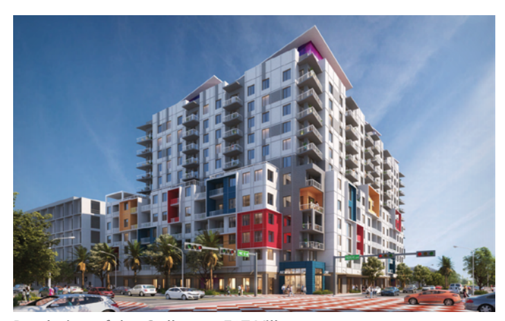
Rendering of the Gallery at FAT Village