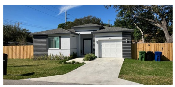
New Scattered Site Infill Housing in Durrs Neighborhood - GESMAC Development

In 2021, five developers were selected to participate in the CRA Scattered Site Infill Housing Project following the issuance of a Request for Proposals to construct and sell single- family homes on CRA owned properties. The CRA provides the land at no cost, allowing developers to pass these savings onto homebuyers, making homeownership more affordable within the CRA boundaries.