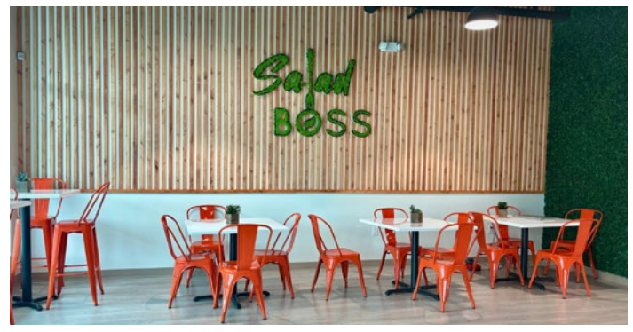
Salad Boss Inc. dine in and take out restaurant at the L.A. Lee YMCA / Mizell Community Center.