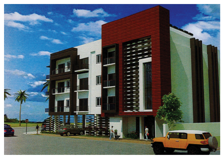
Rendering of New Hope Affordable Housing Development