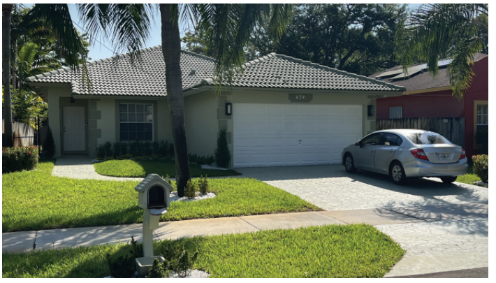
CRA Façade and Landscaping Program Improvements in Dorsey Riverbend