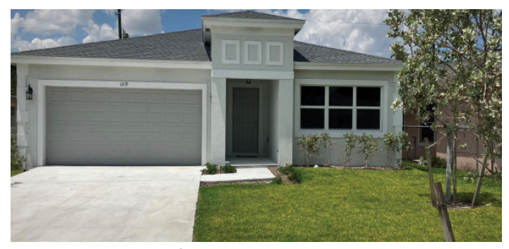
New Scattered Site Infill Housing in Dorsey Riverbend WWA Development