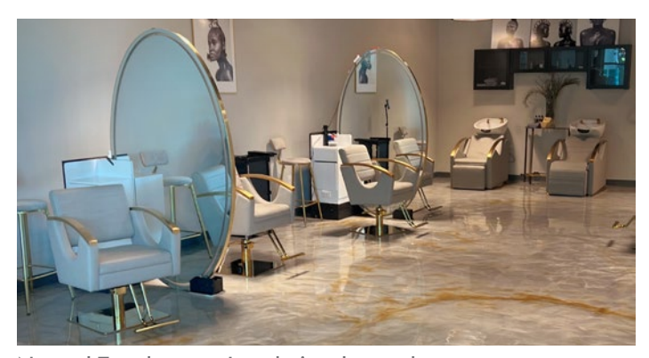
Natural Trendsetters, Inc. hair salon at the L.A. Lee YMCA / Mizell Community Center.