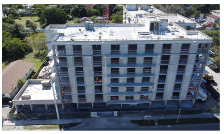
Construction of Mount Hermon Apartments