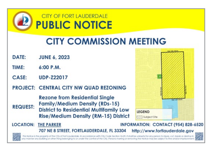
Public Rezoning June 6 meeting sign

The Northwest Quadrant Proposal underwent initial review by the Planning and Zoning Board (PZB) on November 16, 2022. Following further discussions and the need to address questions and concerns from the PZB and gather additional community feedback, the item was deferred to January 18, 2023, and subsequently deferred again to April 19, 2023. A presentation on the next steps was made to the PZB on