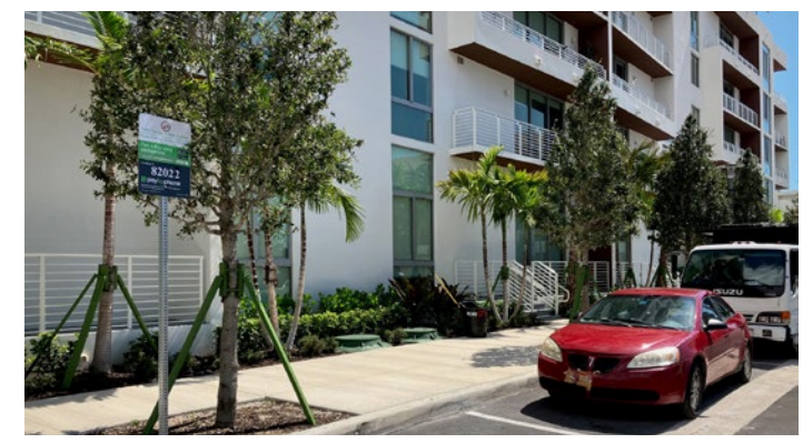
Quantum mixed-use development

In accordance with the NPF CRA Community Redevelopment Plan, the CRA will invest in development projects that promote the overall quality of life, create jobs opportunities for area neighbors, promote sustainability, promote public/